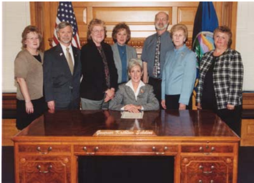
Governor Sebelius signed proclamation making March Certified Government Financial Manager month.

The PDC scheduled for May 12th and 13th will provide members with an excellent opportunity to network, and discuss issues affecting professionals in government. We are expecting a healthy turnout of professionals and encourage all members to register for this occasion.